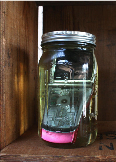
Intimacies of Telephony, installation detail, Margaret Wagner Hart, used cell phone, oil, paper label, 1 quart sized glass canning jar, variable dimensions, 2016-present