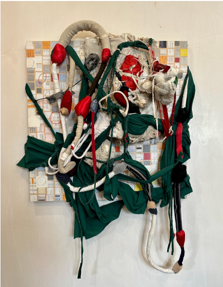
What Remains , Elif Soyer, Mixed Media, 36" x 50" x 12", 2023