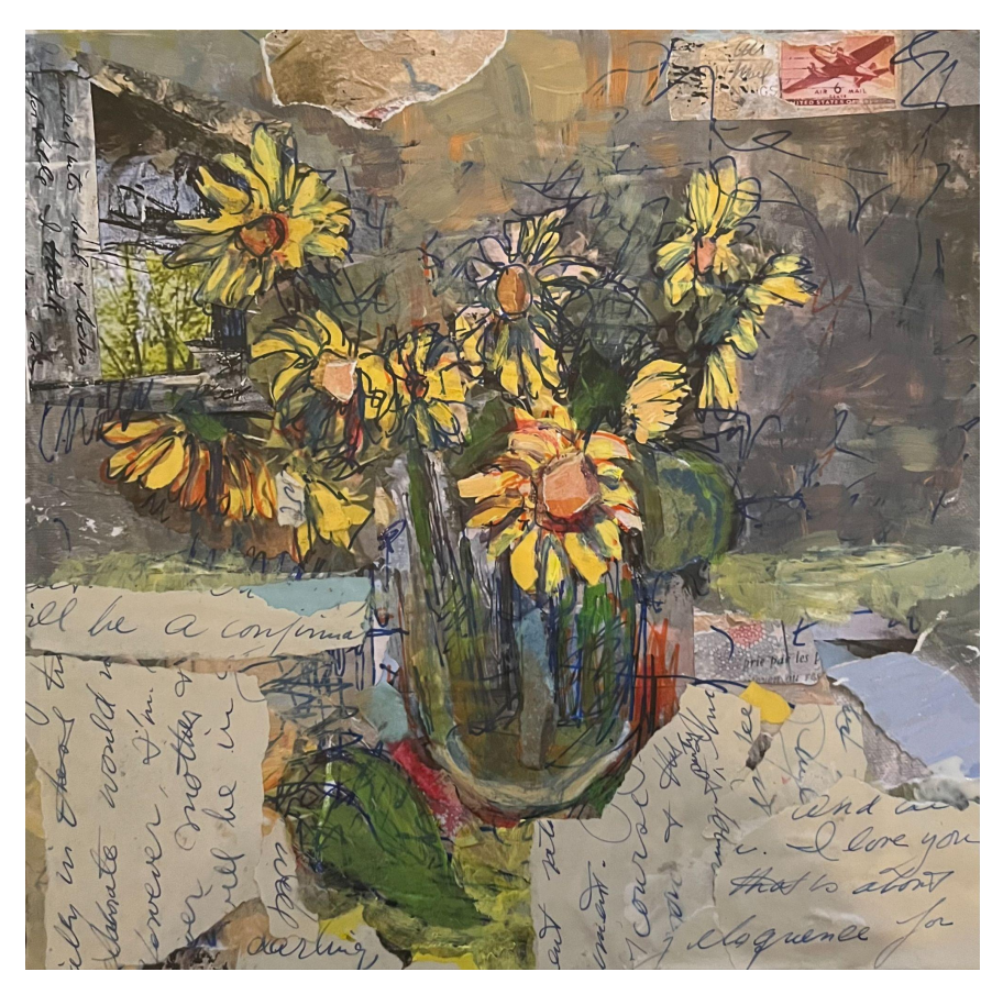
Letters from the Dodge Hotel, Judith Brassard Brown, mixed media, 12' x 12," 2024