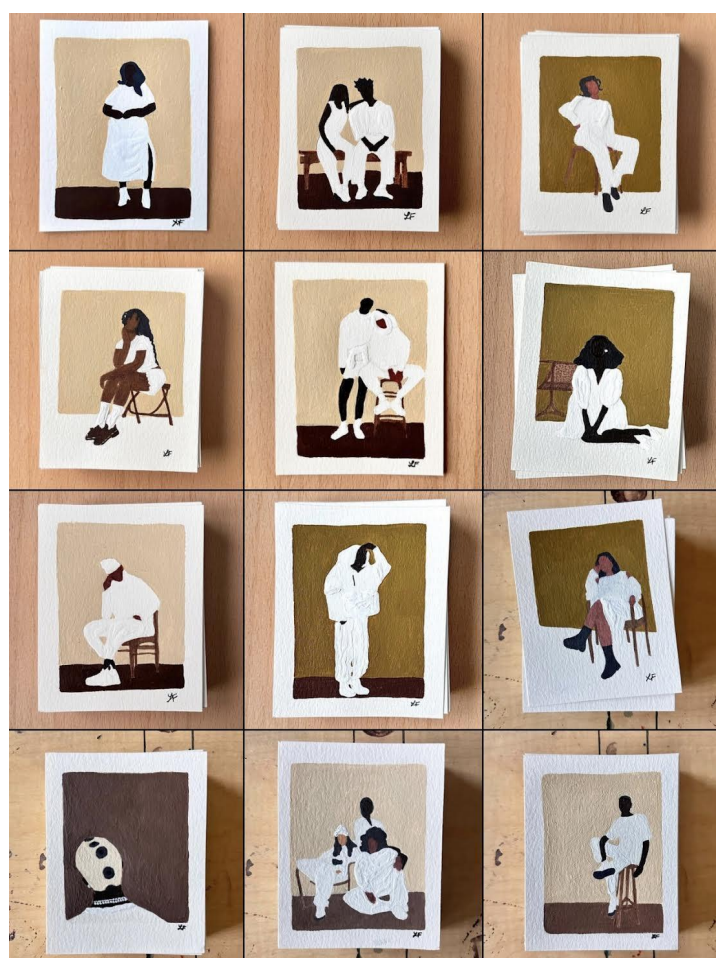
alla us, Liana Farmer, acrylic on paper, 3' x 5,' 2024