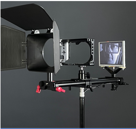
Cover Shot , Andrew Neuman, Mixed Media Sculpture , 2023