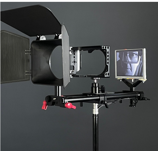
Cover Shot , Andrew Neuman, Mixed Media Sculpture , 2023