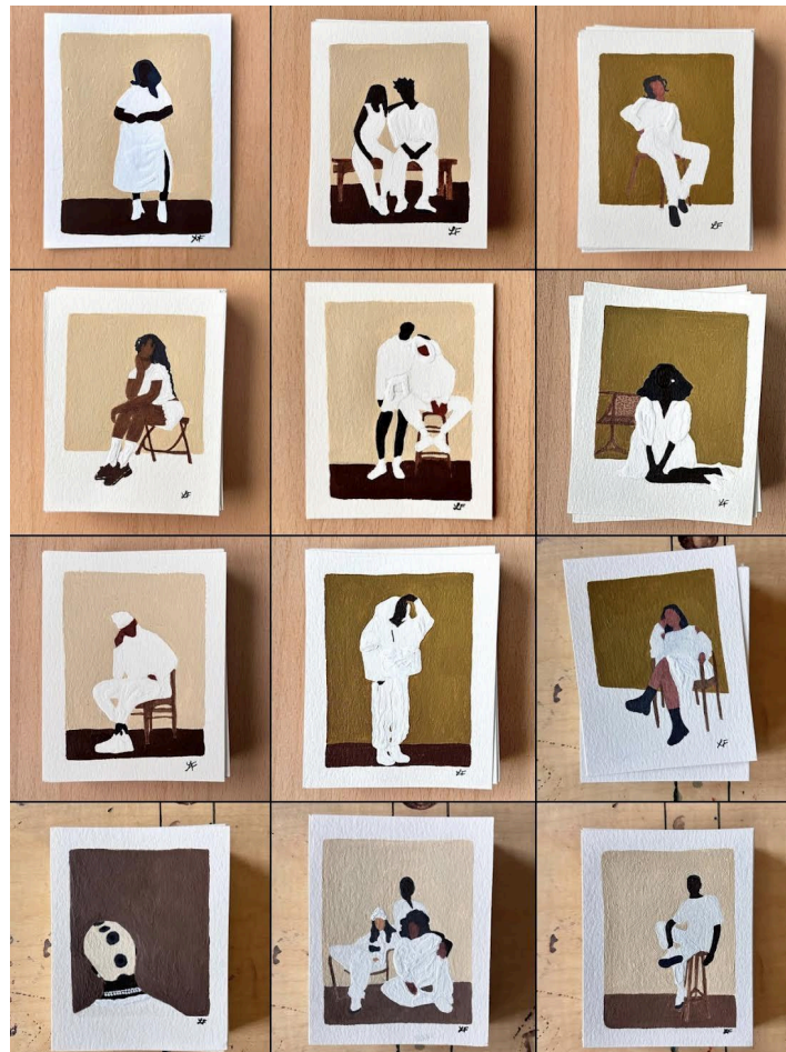
alla us , Liana Farmer, acrylic on paper, 3' x 5', 2024